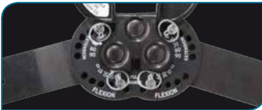
Adjustable Range of Motion Hinge for Gladiator